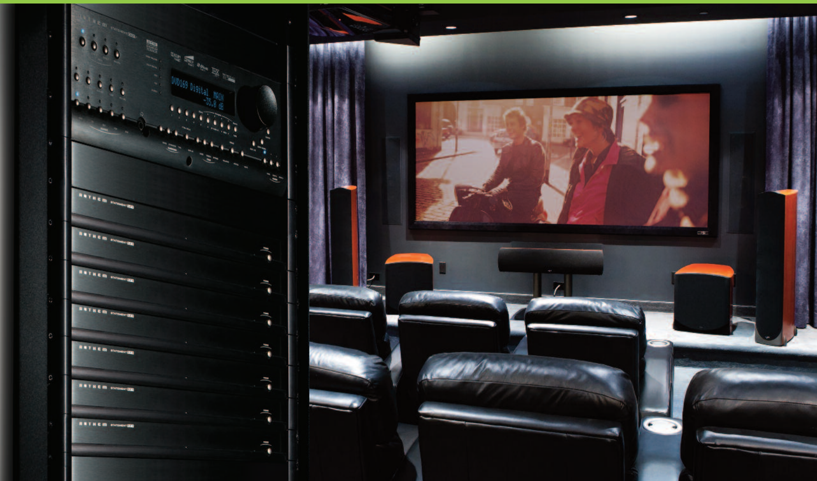
Seven M1s shown in a home theater setup with our Statement D2v A/V Processor and Paradigm's Signature S8 speaker system

2,400W into 3 ohms | 2,000W into 4 ohms | 1,000W into 8 ohms