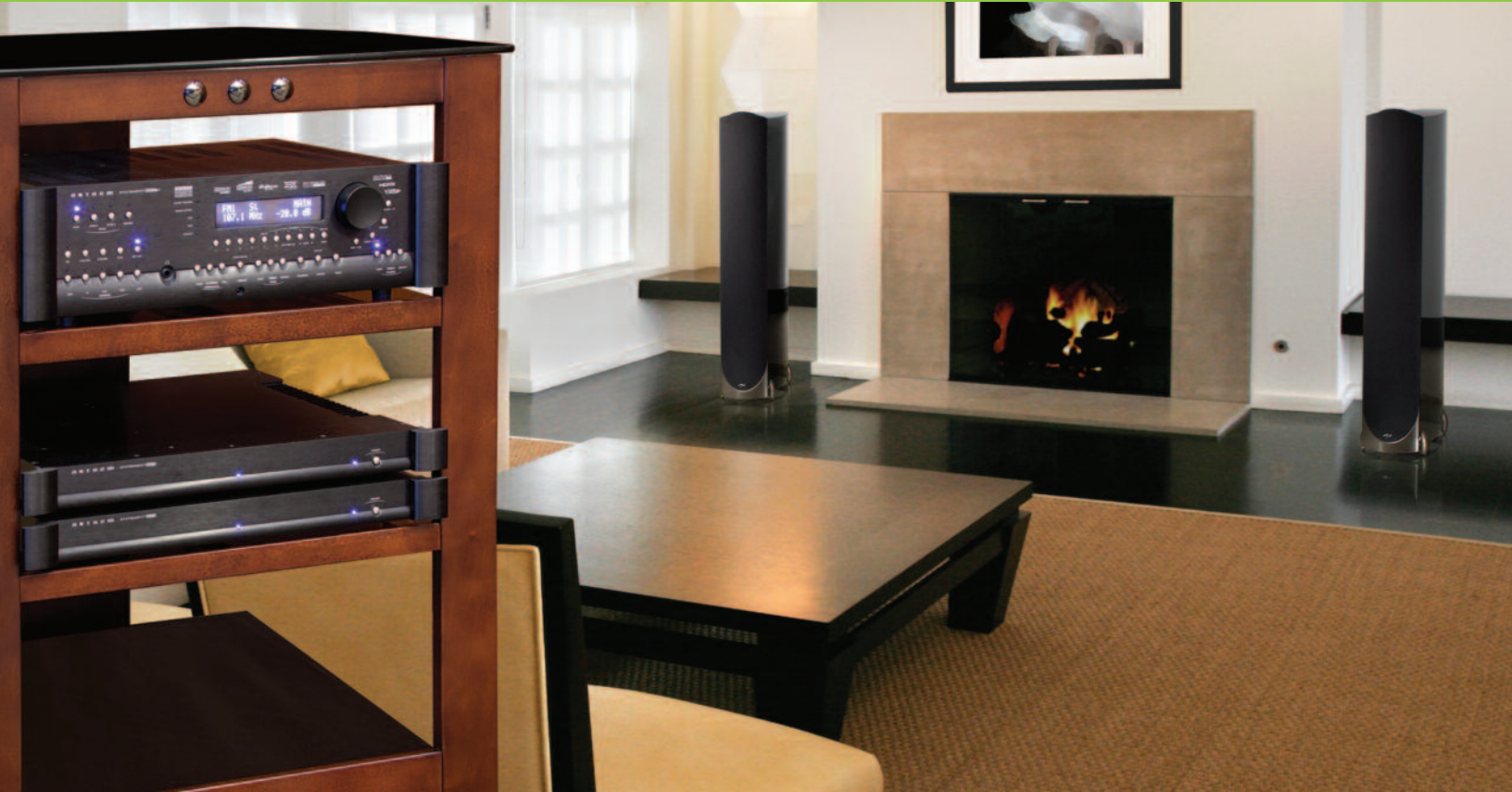
Two M1s shown in a stereo setup with our Statement D2v A/V Processor and Paradigm's Reference Signature S8 speakers. Rack courtesy of SANUS®.

FACT! To test its stamina, we left the M1 running a pair of speakers non stop at high output over three days. When we returned, the M1 was singing as clearly and effortlessly as when our test began!