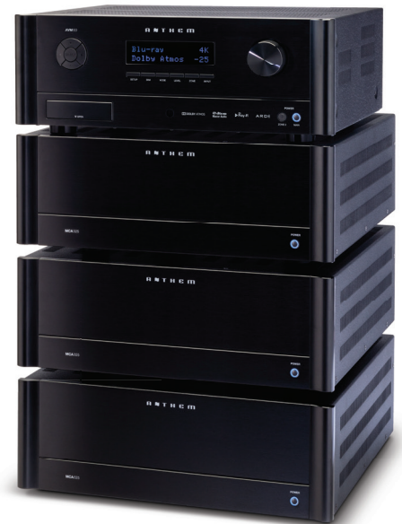
Two MCA 325s and a MCA 525 teamed with an AV60 Preamp

CREATE YOUR OWN DOLBY ATMOS 11-CHANNEL SYSTEM