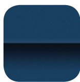
Deep Sea Blue Metallic Blue