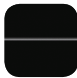
Basalt Black Metallic Black