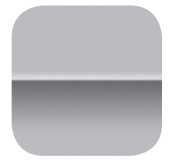
Meteor Grey Metallic Silver (Dark)