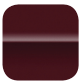
Cordoba Red Metallic Maroon