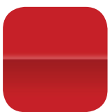
Rosso Fuoco Gloss Red