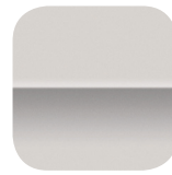
Desert Silver Metallic Silver (Tan Tint)